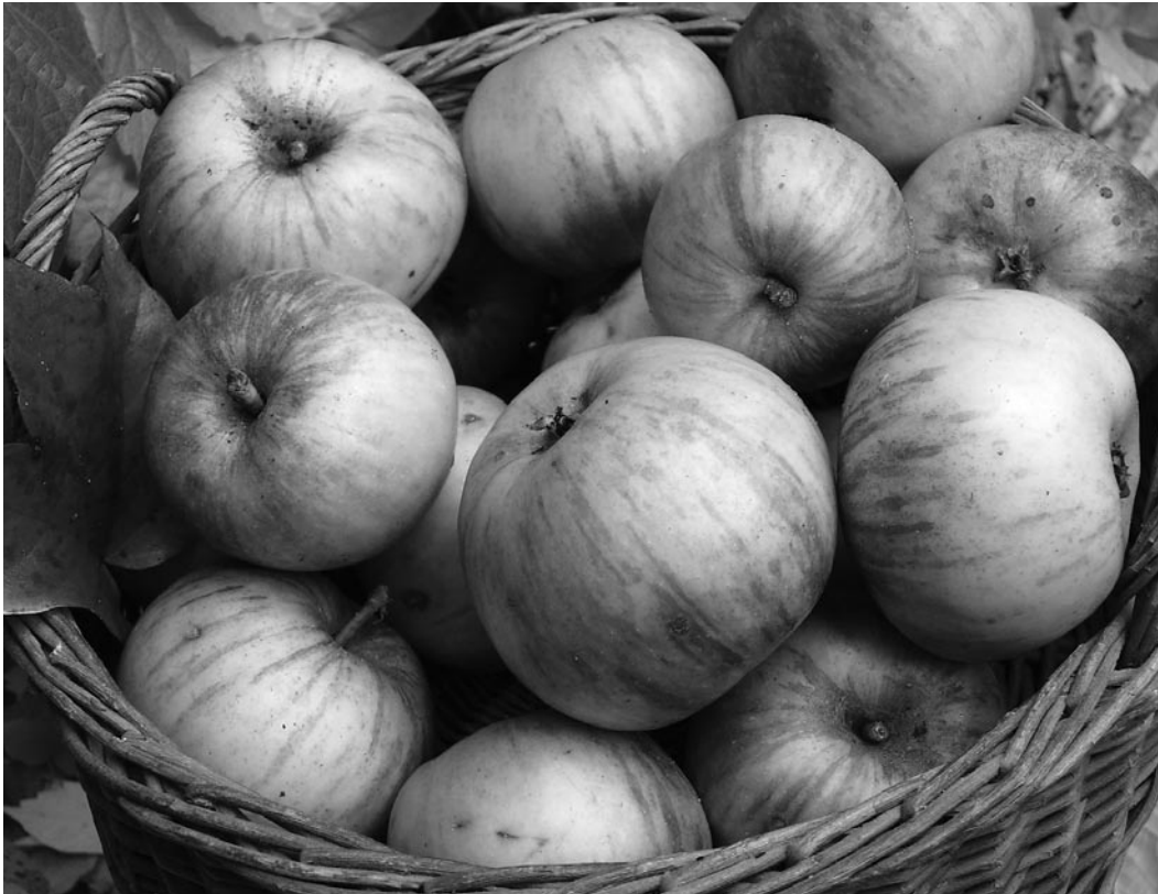
Figure 2: A story with apples.

as the world conference on urbanism, Urban 21, in Berlin. Real estate developers doing business all over Germany were overheard telling the story in other regions, describing the Bonn region as a best-practice-model for regional cooperation that also meets the needs of project development.