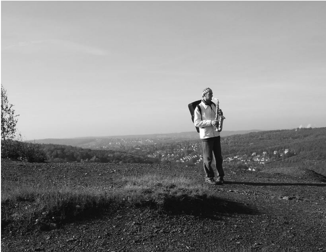
Figure 4: Melodies from a slagheap.

vision”, allowing for individual use and interpretation of open space.